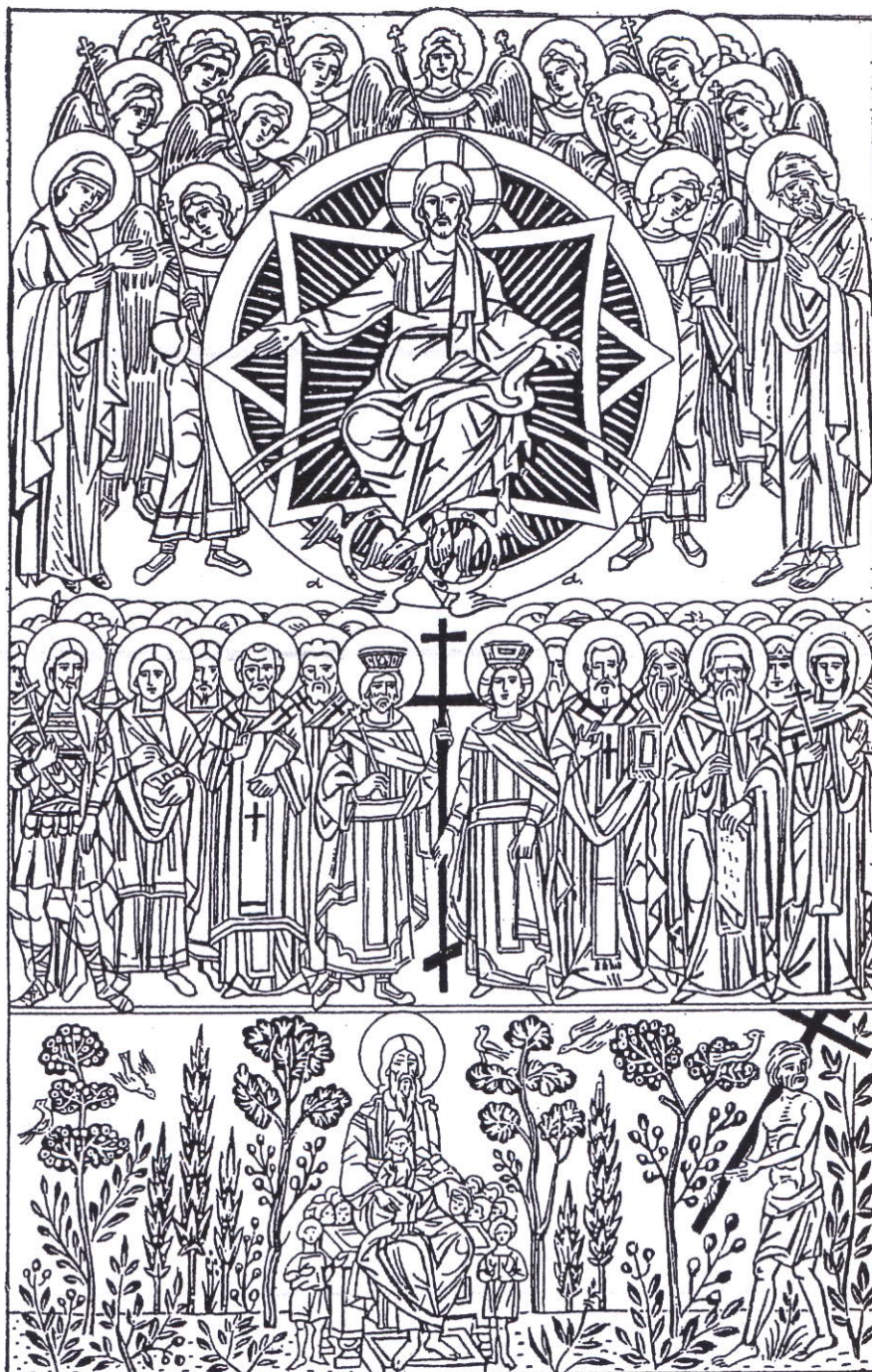
CHRIST REIGNS OVER HIS CHURCH