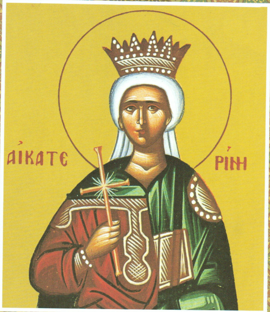
Great Martyr CATHERINE