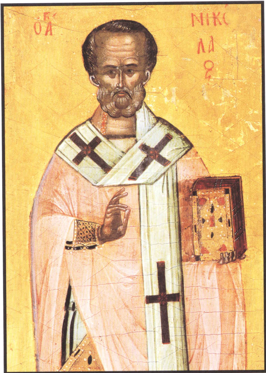
The manna of St. Nicholas serves as a source of help and hope for all believers.