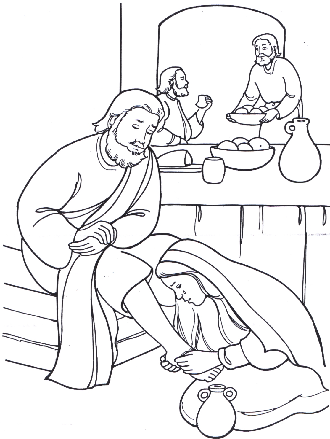
Jesus Is a Friend to a Woman Needing Forgiveness