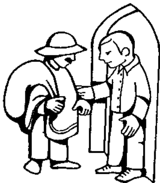
Welcome the stranger