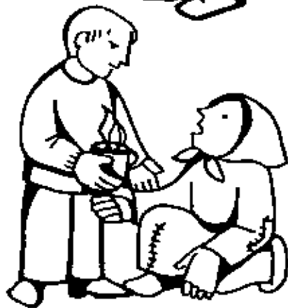
Give drink to the thirsty