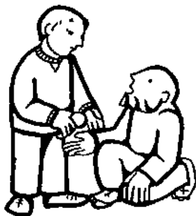
Feed the hungry