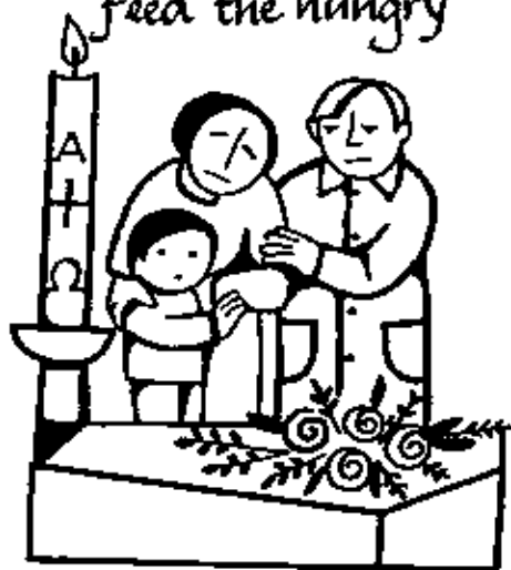
Bury the dead