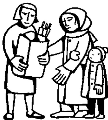
Feed the hungry