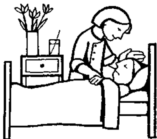
Visit the sick