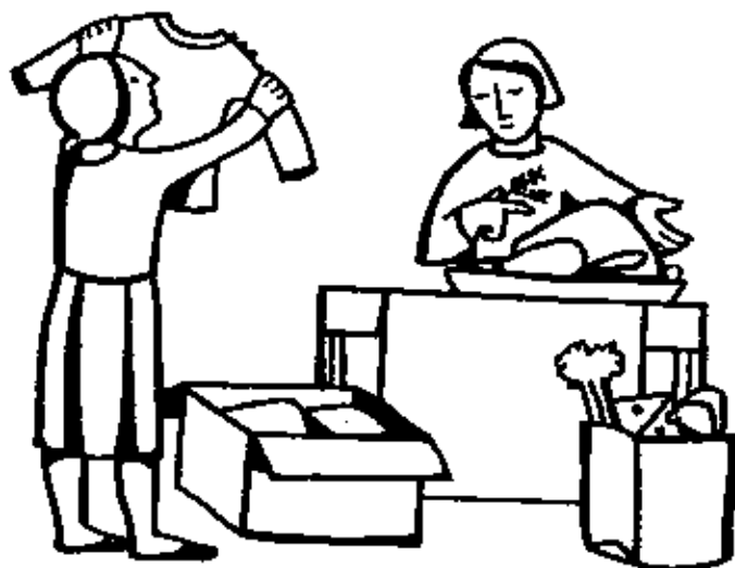
Clothe the naked