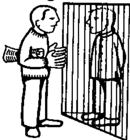
Ransom the captive