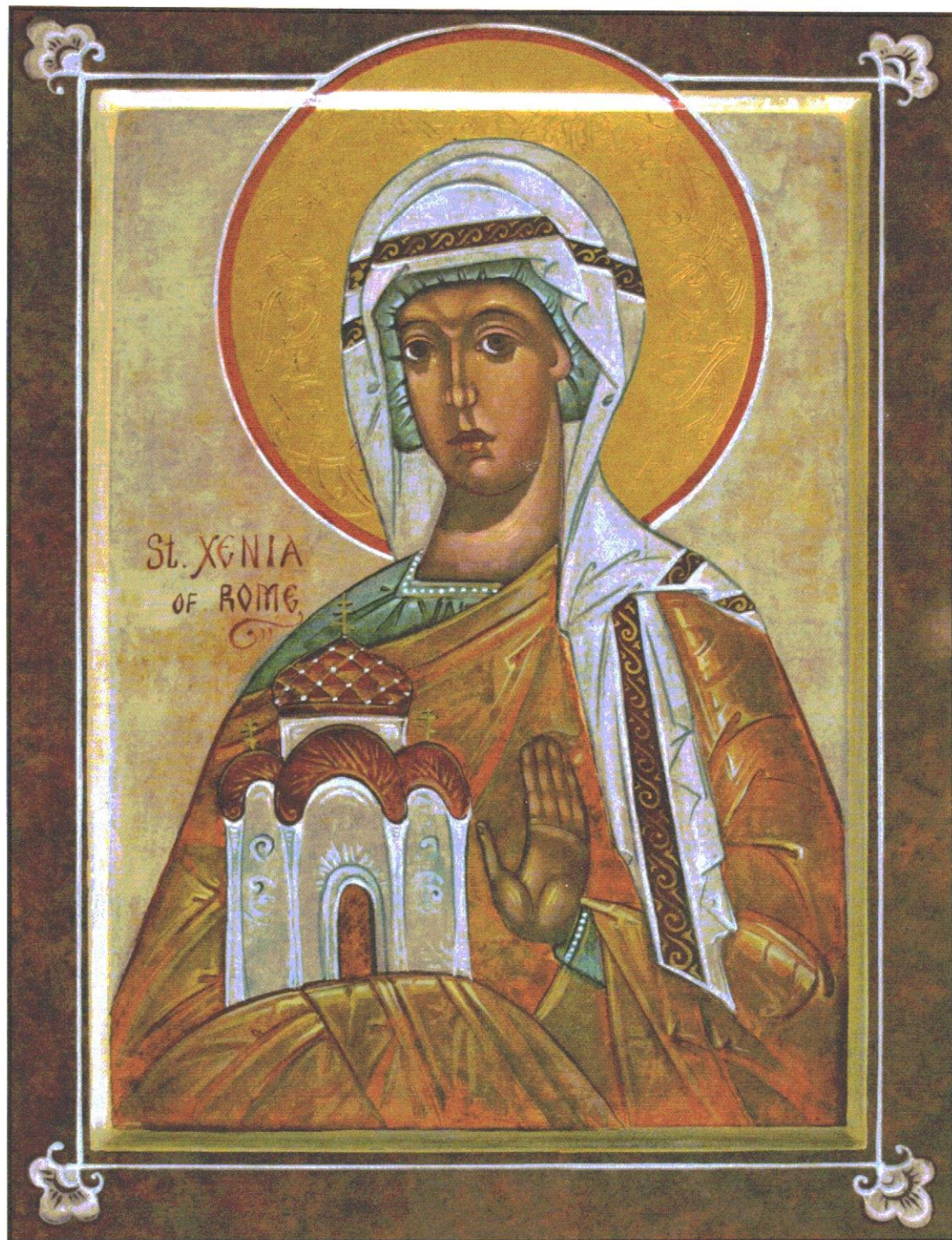
ST. XENIA OF ROME