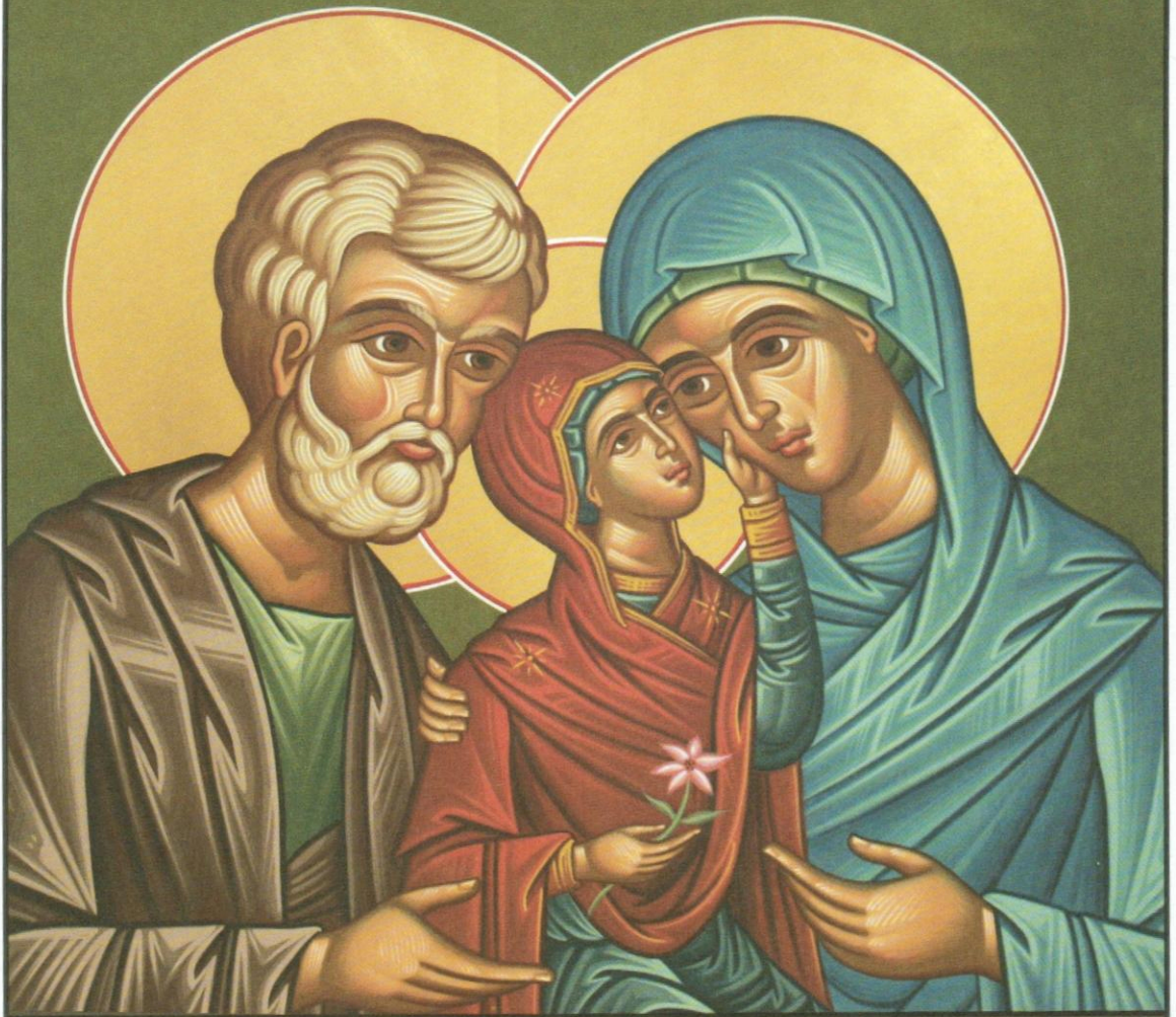
THE VIRGIN MARY WITH HER RIGHTEOUS PARENTS JOACHIM AND ANNA