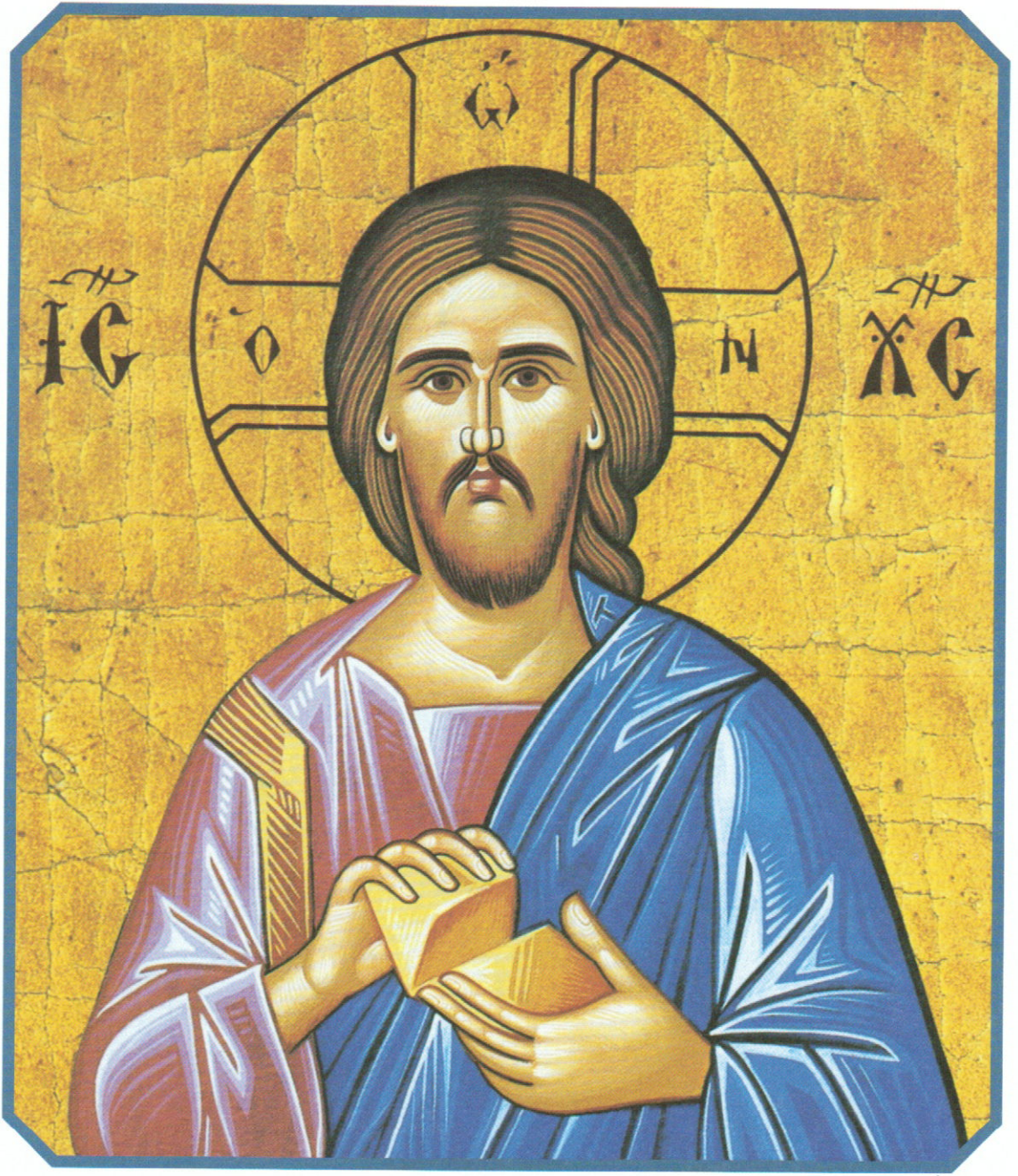
THE SACRAMENT OF HOLY COMMUNION