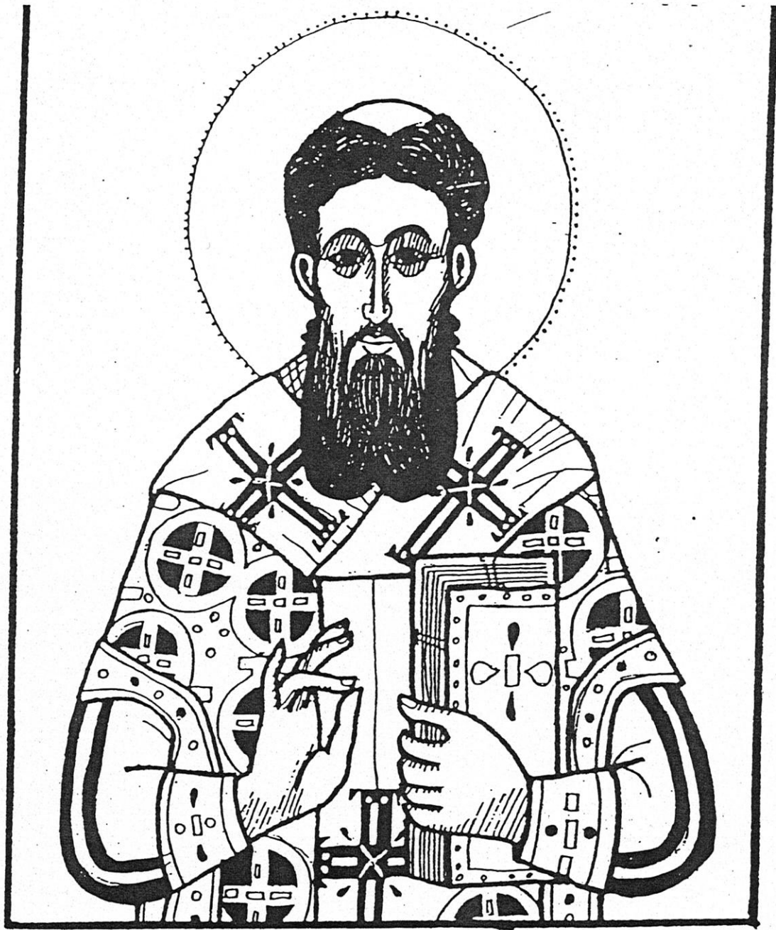
Sunday of St. Gregory Palamas Mark 2:1-12