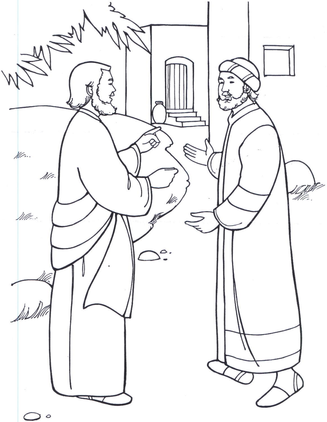
Jesus Heals an Official's Son