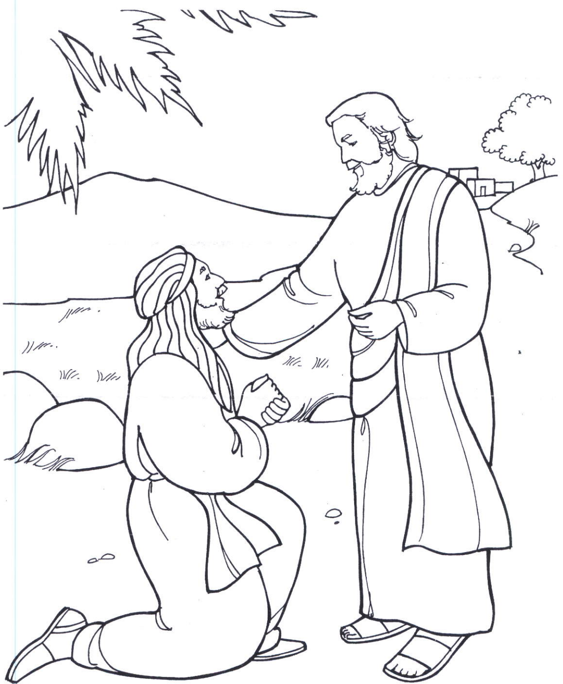
Jesus and the Ten Men with Leprosy