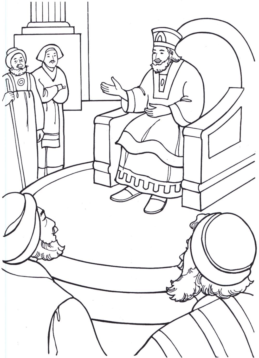
Solomon Prays for Wisdom