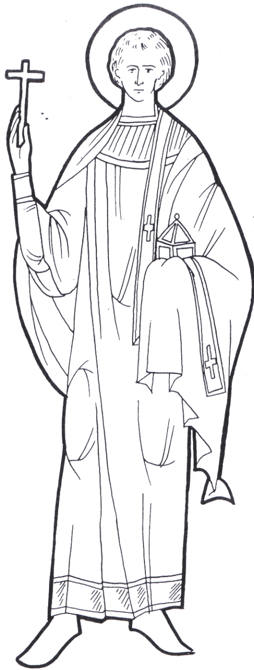
St. Stephen—The First Martyr