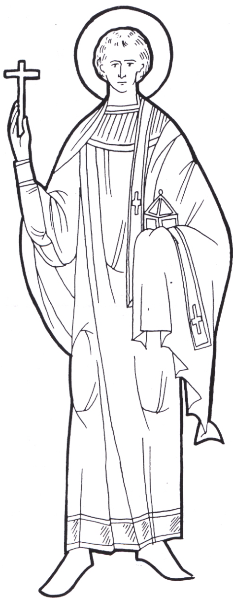
St. Stephen—The First Martyr